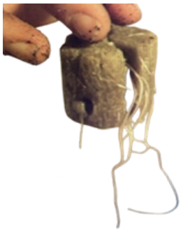
Figure 1 Fully Rooted Clone Fed with Terra Vera