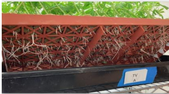
Figure 2 Clone Tray A (Terra Vera) at Day 16

In a time-paired study conducted with the cultivation team at Pecos Valley Production (PVP) in Roswell, New Mexico, several hundred clones were grown after being cut from five strains of cannabis.*